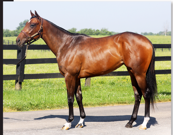
Conformation Left Side

Your horse should face left in a well-balanced position. You want your horse to appear alert, but you do not want the head to be held too high. Always make sure the ears are pricked! The front left leg should be straight from the shoulder to the ground with the right front slightly behind. The left hind leg should be straight from the hock to the fetlock with the right hind positioned slightly in front.