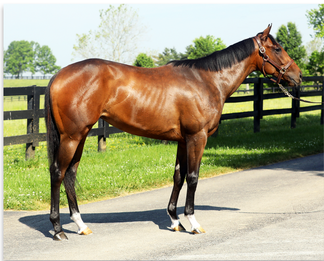
Conformation Right Side