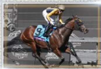
FOUR WHEEL DRIVE