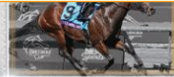
FOUR WHEEL DRIVE