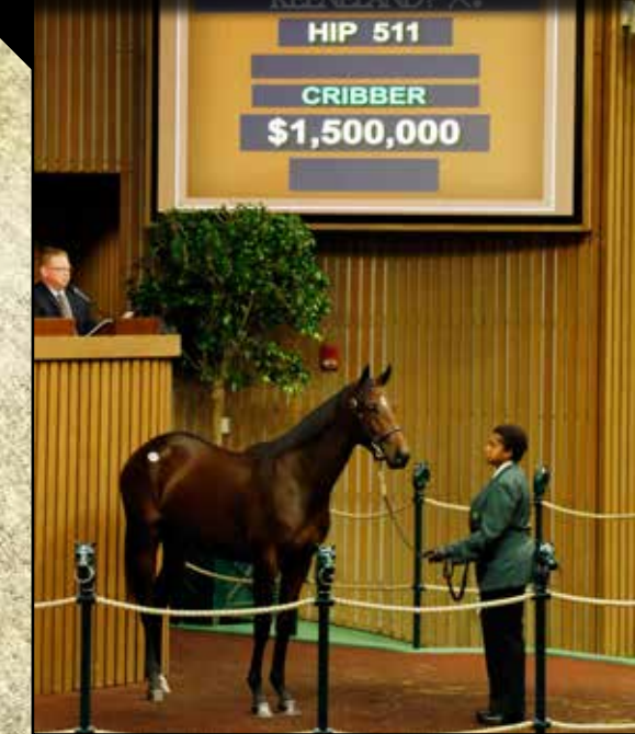
$1,500,000 (Bernardini - Pilfer) 2015 Keeneland September Sale

HIGHEST-PRICED YEARLING FILLY SOLD IN NORTH AMERICA IN 2015!