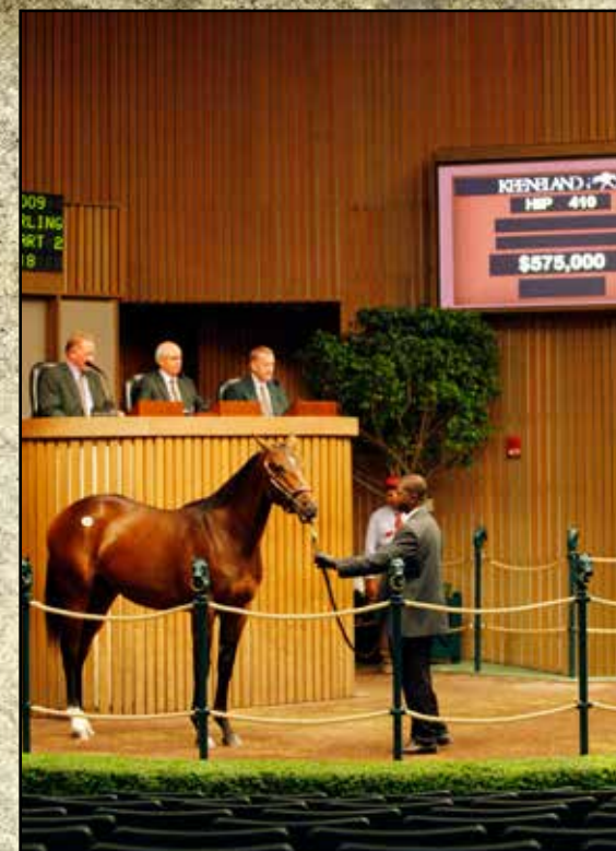
$575,000 TO HONOR AND SERVE (Bernardini - Pilfer) 2009 Keeneland September Sale