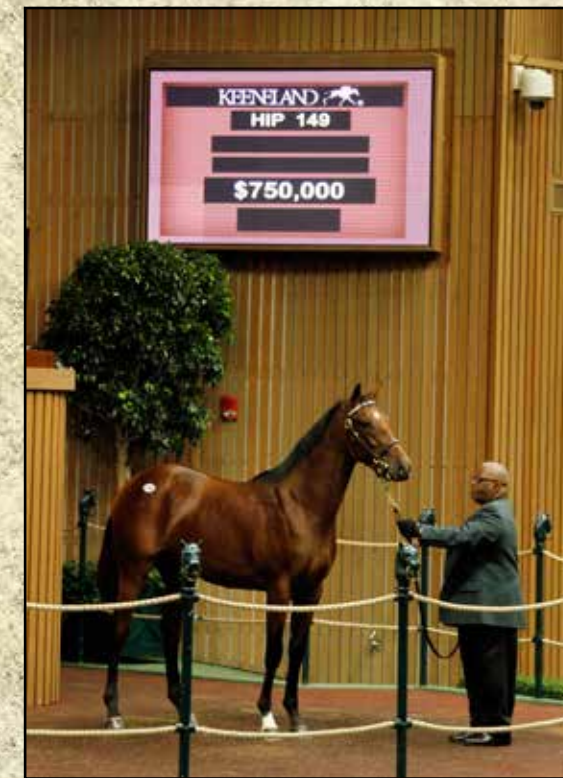
$750,000 (Bernardini - Pilfer) 2014 Keeneland September Sale

HIGHEST-PRICED YEARLING FILLY SOLD IN NORTH AMERICA IN 2015!