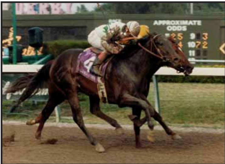
Champion sire, BRIAN'S TIME