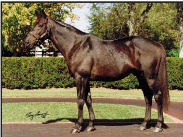
Champion sire, DYNAFORMER

“ The success of BRIAN'S TIME, sire of five Champions in Japan, and DYNAFORMER, who has been represented by champions and classic winners on three different continents, underlines the stallion producing potential of this female line.”