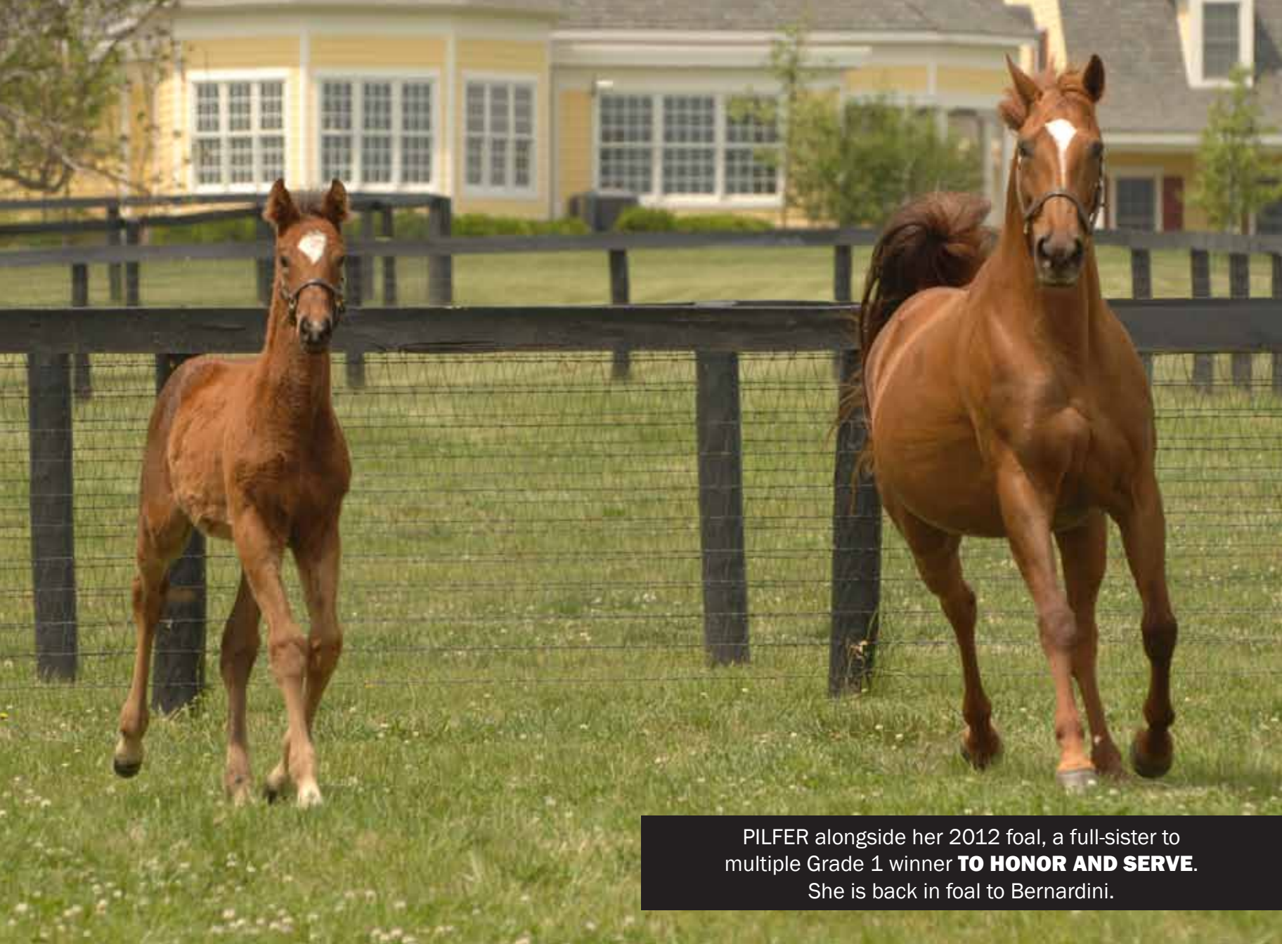
PILFER alongside her 2012 foal, a full-sister to multiple Grade 1 winner TO HONOR AND SERVE . She is back in foal to Bernardini.