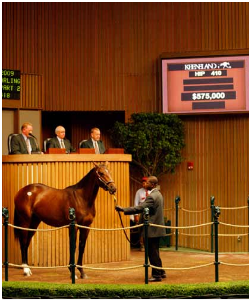
Selling at the 2009 Keeneland September Yearling Sale