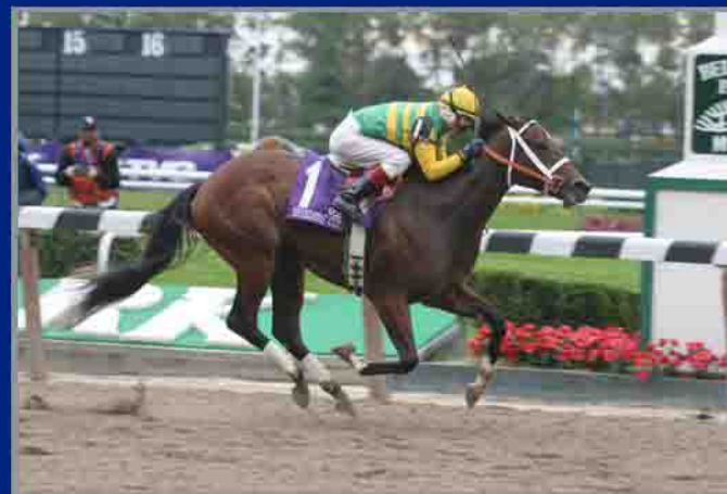
FOLKLORE winning the G1 Breeders' Cup Juvenile Fillies

QUEEN ' S LADY is a full-sister to the dam of Folklore , whose commanding victory in the G1 Breeders' Cup Juvenile gives her a lock on the Eclipse Award in the 2-year-old filly division. This is also the immediate family of dual Classic-winning Champion Smarty Jones .